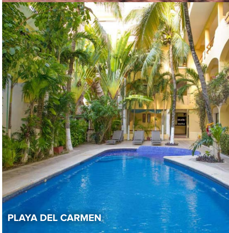
PLAYA DEL CARMEN